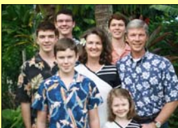
The English Family

Monthly Supporting Congregations & Organizations